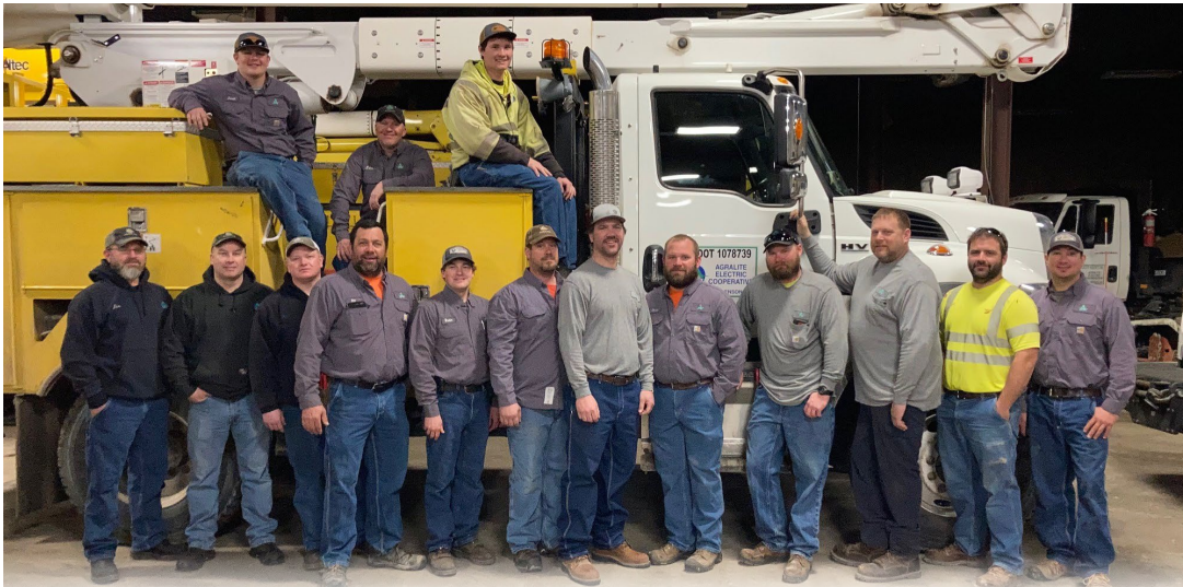
Pictured above: Agralite's 10 linemen, along with our meter tech, construction engineer, warehouseman, mechanic, and cable locator

Agralite Electric Cooperative invites all co-op members to take a moment and thank a lineworker for the important work they do. On April 10, you can use #ThankALineworker on social media to show your support for the brave men and women who power our lives.