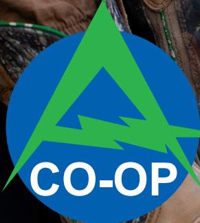
October Calendar Photo Contest Winner